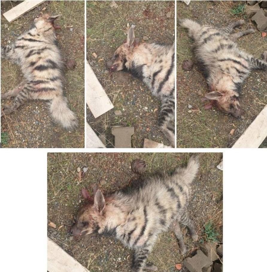
Figure 2. Male individual killed as a result of vehicle collision

This is the first specimen-based record of Hyaena hyaena (striped hyena) from Bingöl province (Figure 2). A male individual of the species died shortly after being hit by a vehicle on the D950 highway between Çobantaşı and Hacılar villages. The dead individual was taken away by the Bingöl Nature Protection and National Parks Branch Directorate after it was photographed. The general vegetation of the region is covered with openings formed by steppes and forested areas consisting of oak trees in places. However, the Capra aegagrus (rock goat) population is intensively observed in the area (Erkan DAVRAN (Bingöl Nature Conservation and National Parks Branch Directorate) pers. comm. 2021).