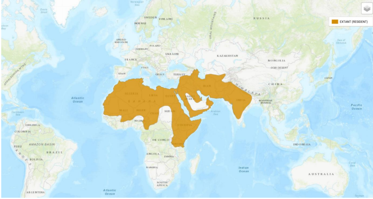
Figure 1. Geographic range of Hyaena hyaena in the world [4]

In the last two decades, numerous studies have been conducted on the striped hyena in Türkiye. In the early 21st century, Kasperek et al., [7] reported that the species was on the verge of extinction in their study on the status and distribution of the striped hyena in Türkiye. Akay et al., [1] used geographic information systems (GIS) and remote sensing technologies to monitor and assess the distribution of striped hyena in Hatay-Altınözü. As a result of the study, they stated that the striped hyena was most common in agricultural areas, especially olive groves, followed by maquis shrublands. Akarsu [8] prepared a species action plan for the striped hyena. Çoğal et al., [9] conducted a camera trap and survey study in Hatay province and detected the striped hyena thanks to the camera traps that were set up in the area between Hassa and Reyhanlı districts of Hatay. In addition, Çoğal et al., [10] made an up-to-date assessment of the current status and distribution of the striped hyena in Türkiye.