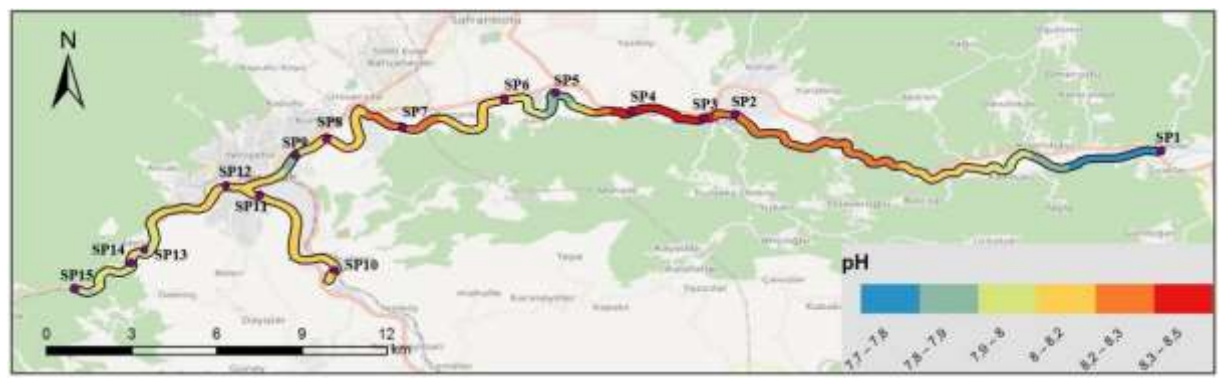
Figure 4. pH values