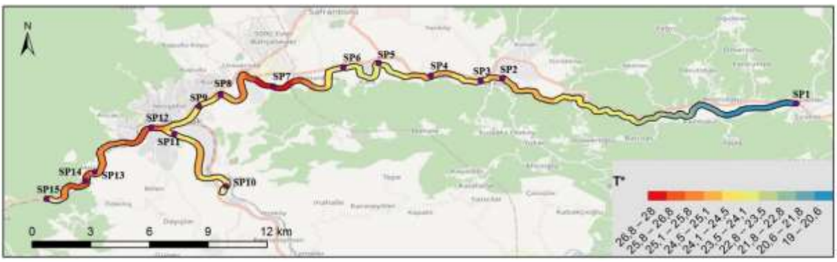
Figure 3. Temperature values (*°C)